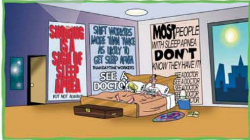
"HEAR, ARE YOU TRYING TO TELL ME SOMETHING?"